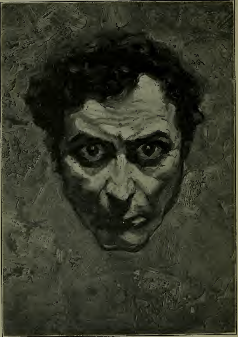
It was there again, the deathly grey face.